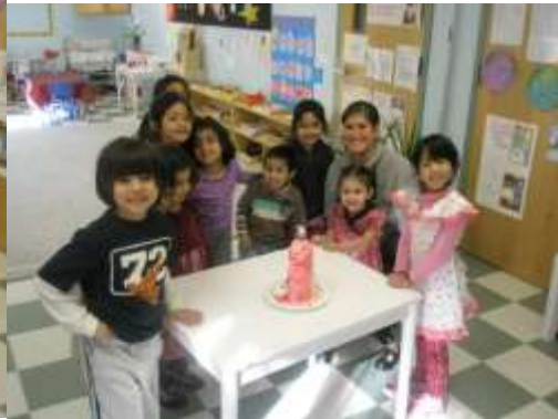
Above: Making a Volcano