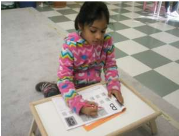
Below: Writing in Handwriting without tears