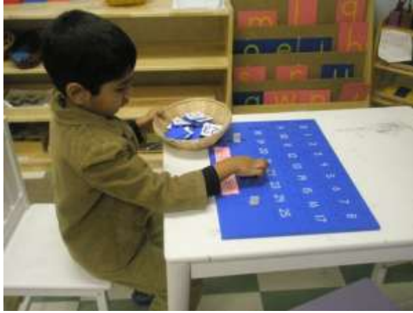
Below: Working on numbers