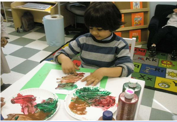
Finger paint apple trees

"I live in heaven. My home is a sphere that turns around the sun. It is called Earth." ~ Maria Montessori