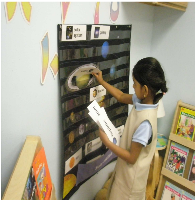
Naming the different planets

Some children work with number rods, we have also worked with sandpaper numbers. Some children are also working on counting and writing numbers. Some Children are working on addition.