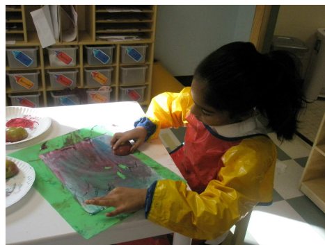
Painting with apples